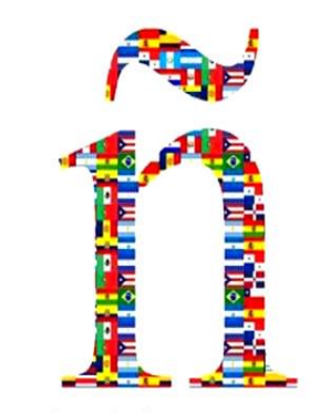
Se habla español