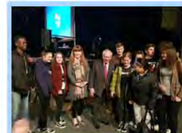
The BWA group with David Starkey.