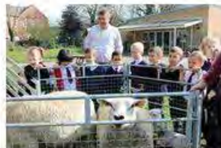
Lambs at Peckover Primary.