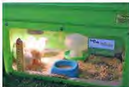
Oakley Vale's day old chicks.

To see more pictures of the lambs, click here .